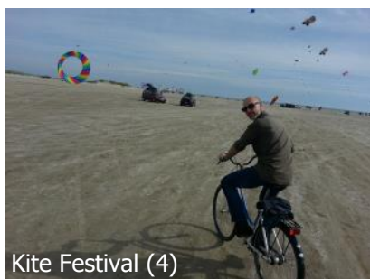
Kite Festival (4)