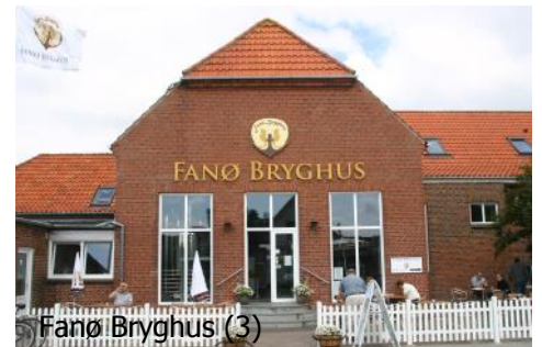
Fanø Bryghus (3)