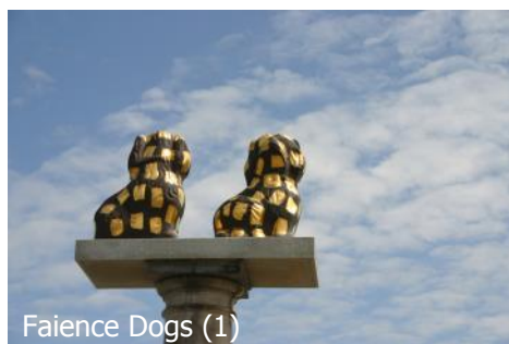
Faience Dogs (1)